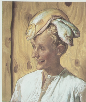
John Currin, The Moroccan, 2004