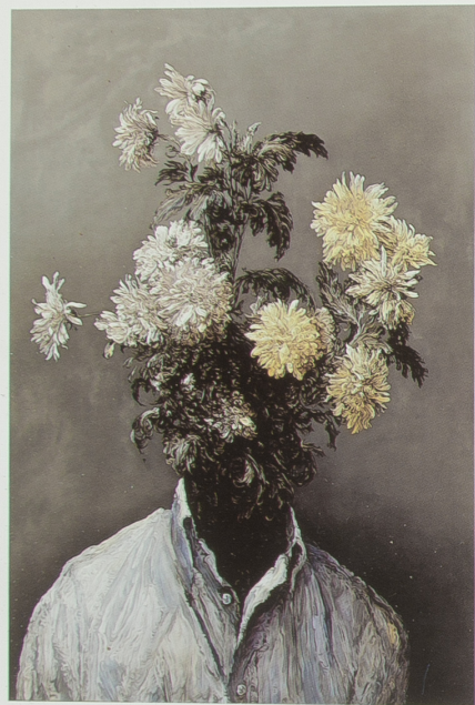
Glenn Brown, Architecture and Morality, 2004