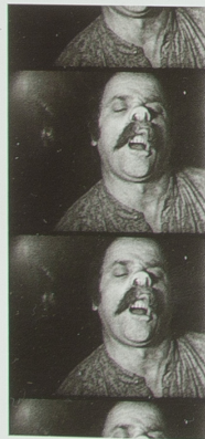
Erró, Grimaces, 1962-1967