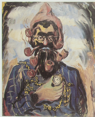
René Magritte, Le Stropiat, 1948