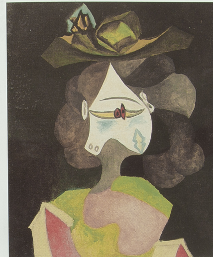
Pablo Picasso, Le Chapeau à fleurs, 1940