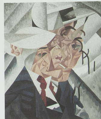
Gino Severini, Autoportrait, 1912/1960