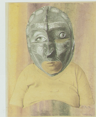
Hannah Höch, Mutter, [1925-1926]