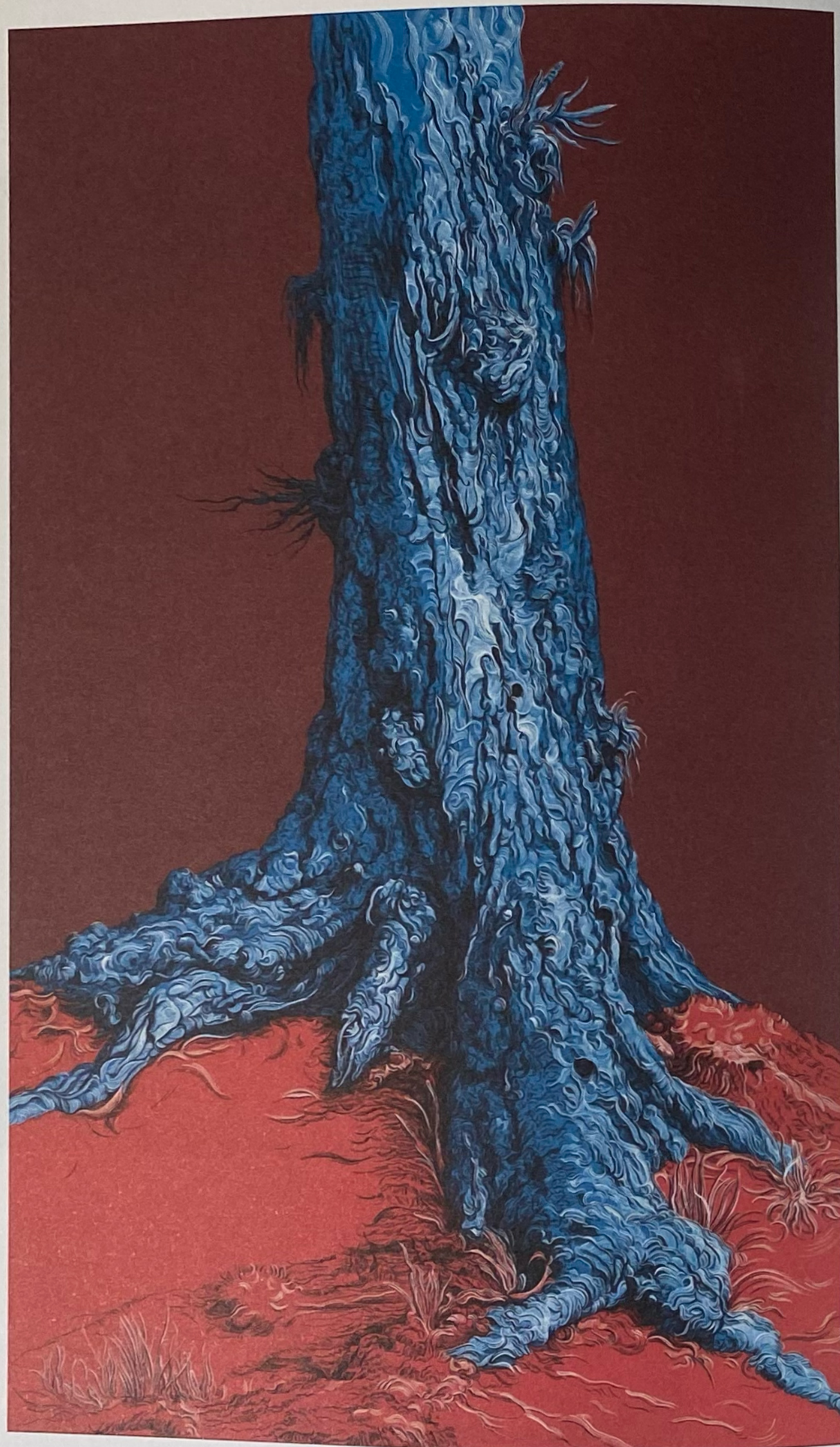
GLENN BROWN The Holy Bible , 2022