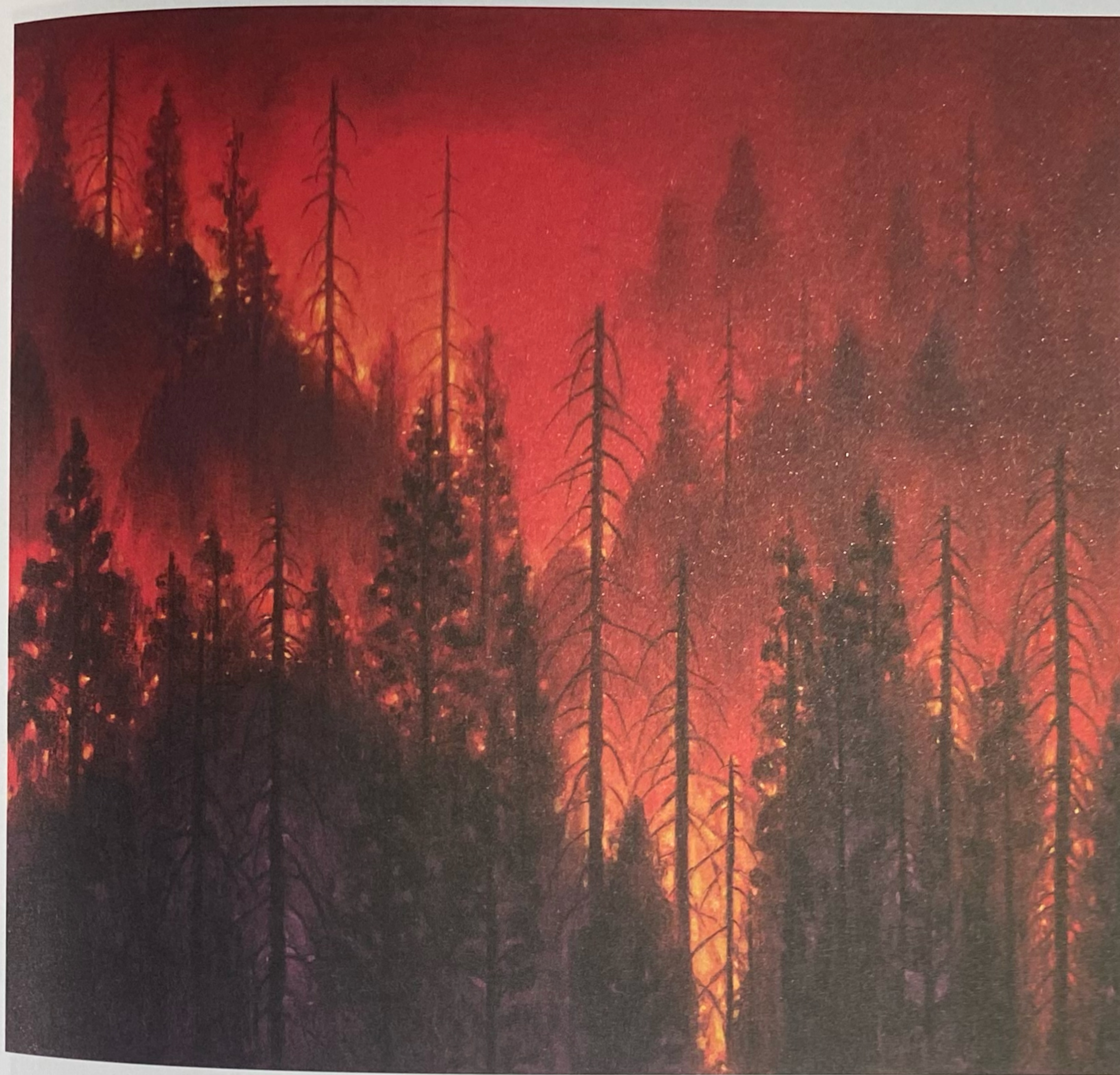
NICOLAS PARTY Red Forest , 2022