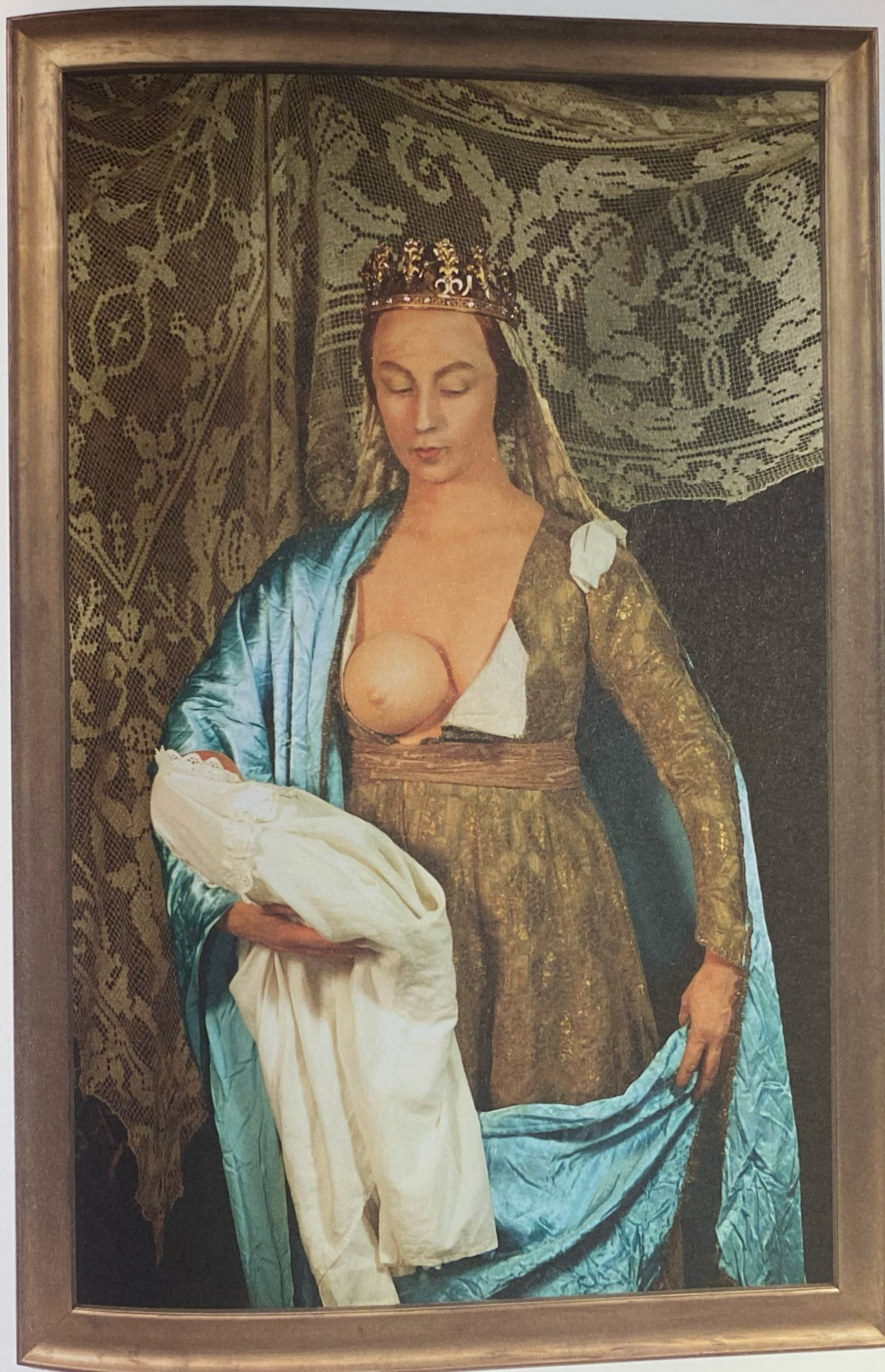
CINDY SHERMAN Untitled #216 , 1989